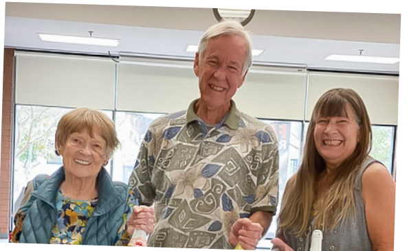
Neurobics Winners - August