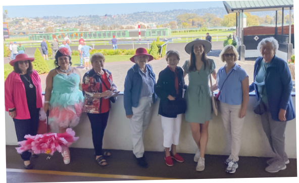
Great Getaway Bus Trip - Horse Races Golden Gate Fields