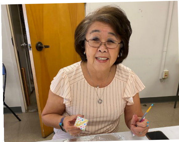
Hands on Art Class