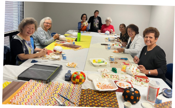
Fall Art - Pumpkin Decoupage