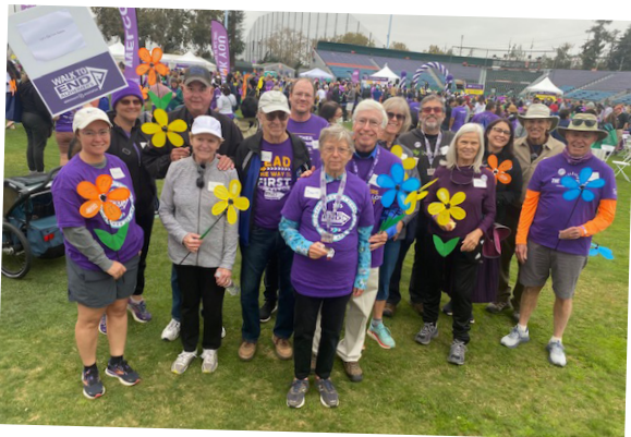
Walk to End Alzheimer's Team "Let's Go Los Gatos"