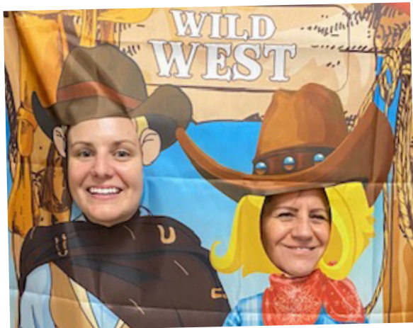
Country and Western Line Dance