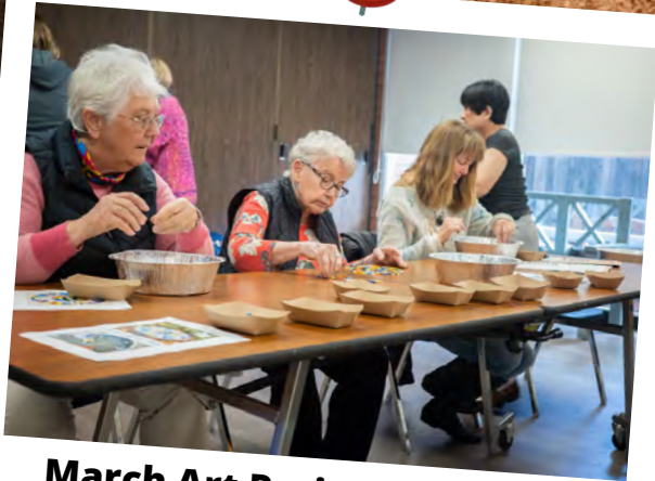
March Art Projects - Mosaic Cement Garden Stones