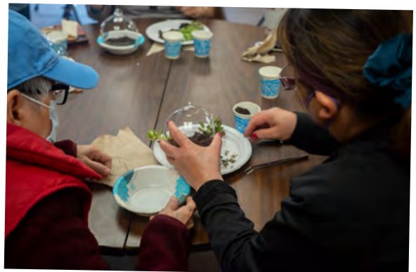
April Art Projects - Terrarium