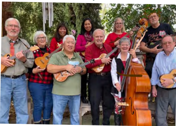
Join us 5/15 for live music from Jazzberry Jam!

Where - Town Park Plaza When - Sundays 9:00AM-1:00PM