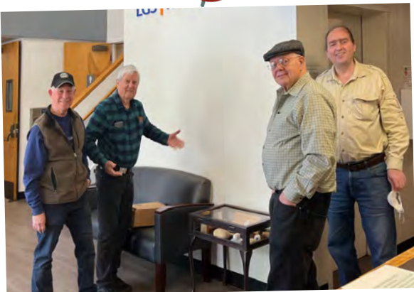
April Woodcarvers EGGSELLENT Display